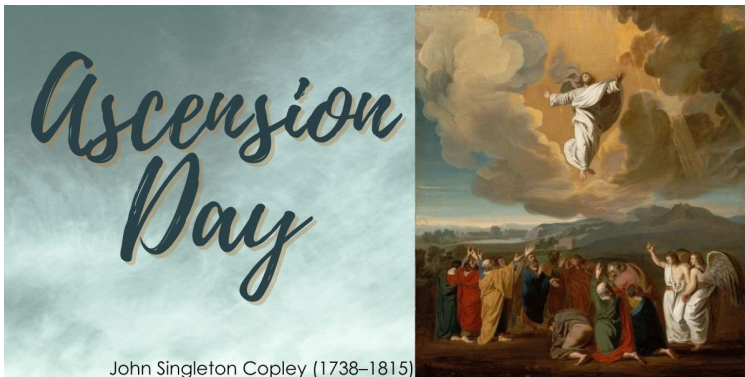
John Singleton Copley (1738-1815)